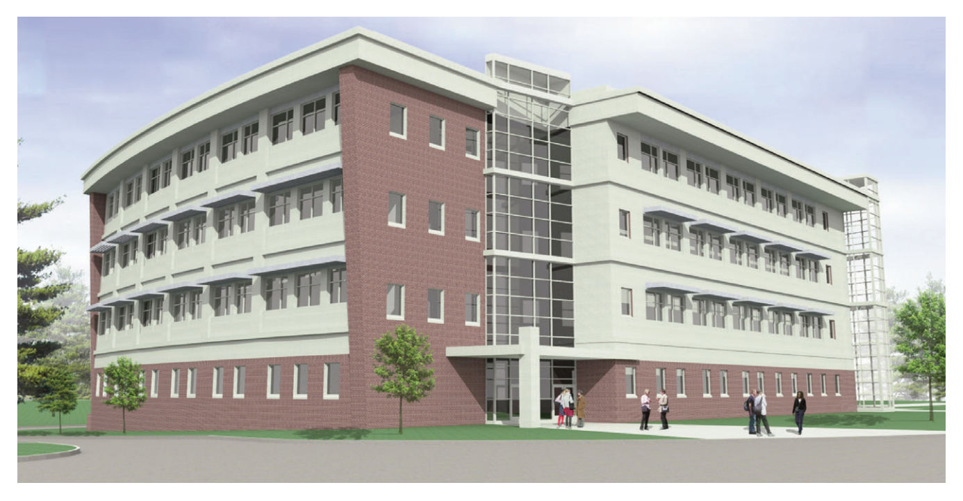
▲ A rendering of the SIUE Science Building, which was under construction during 2011.