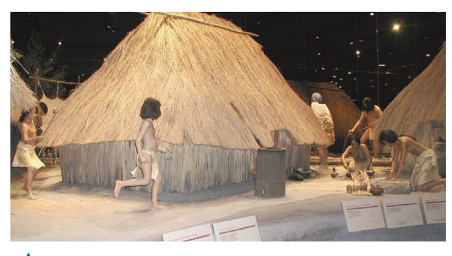
Exhibit at Cahokia Mounds, a UNESCO Heritage site.

2011 also was the year that the Southwestern Illinois Tourism Bureau, based in St. Clair County, expanded its coverage area to 19 counties in Southern Illinois and changed it's name to The Tourism Bureau ILLINOISouth.