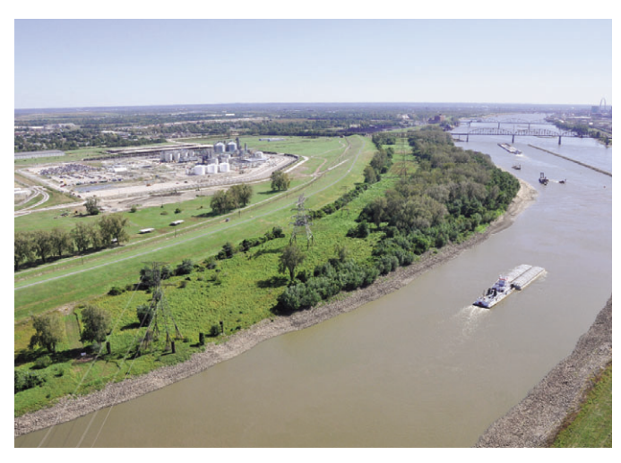
The $161 million Metro East Levee Improvement Project is one that will be underway over the next couple of years.

However, since we're still tracking those "Announced" projects behind the scenes and see that there is well over $1.5 billion in projects on this evolving list, we wanted to spotlight a few significant developments that are likely to break ground in the coming years, or draw your attention to clusters of projects that signal potential growth in key sectors of the economy that should be kept on the radar screen.